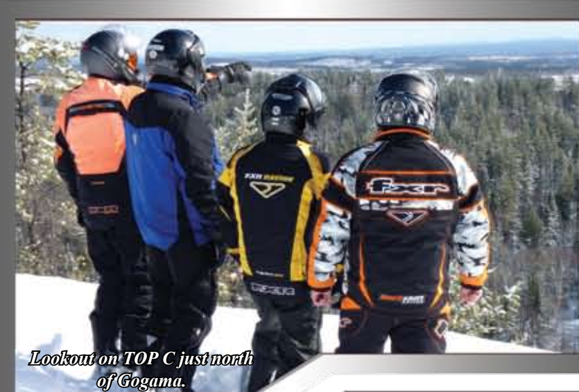
Lookout on TOP C just north of Gogama.