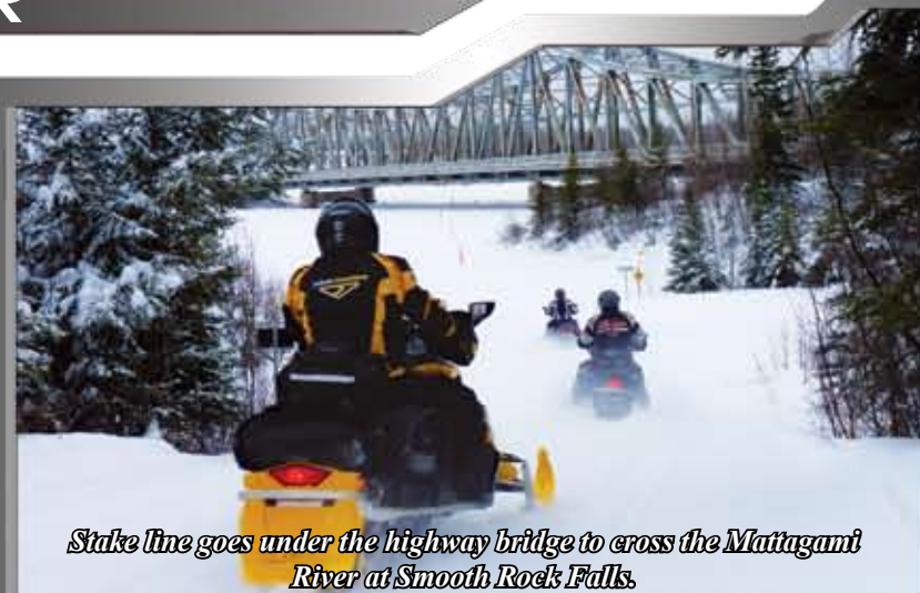
Stake line goes under the highway bridge to cross the Mattagami River at Smooth Rock Falls.

Good news for riders who wish to complete the Big Loop Tour that includes the Northern Corridor plus circling south through Hornepayne, Chapleau, Foleyet and Timmins – the TOP F trail between Missanabie and Chapleau is open this winter!