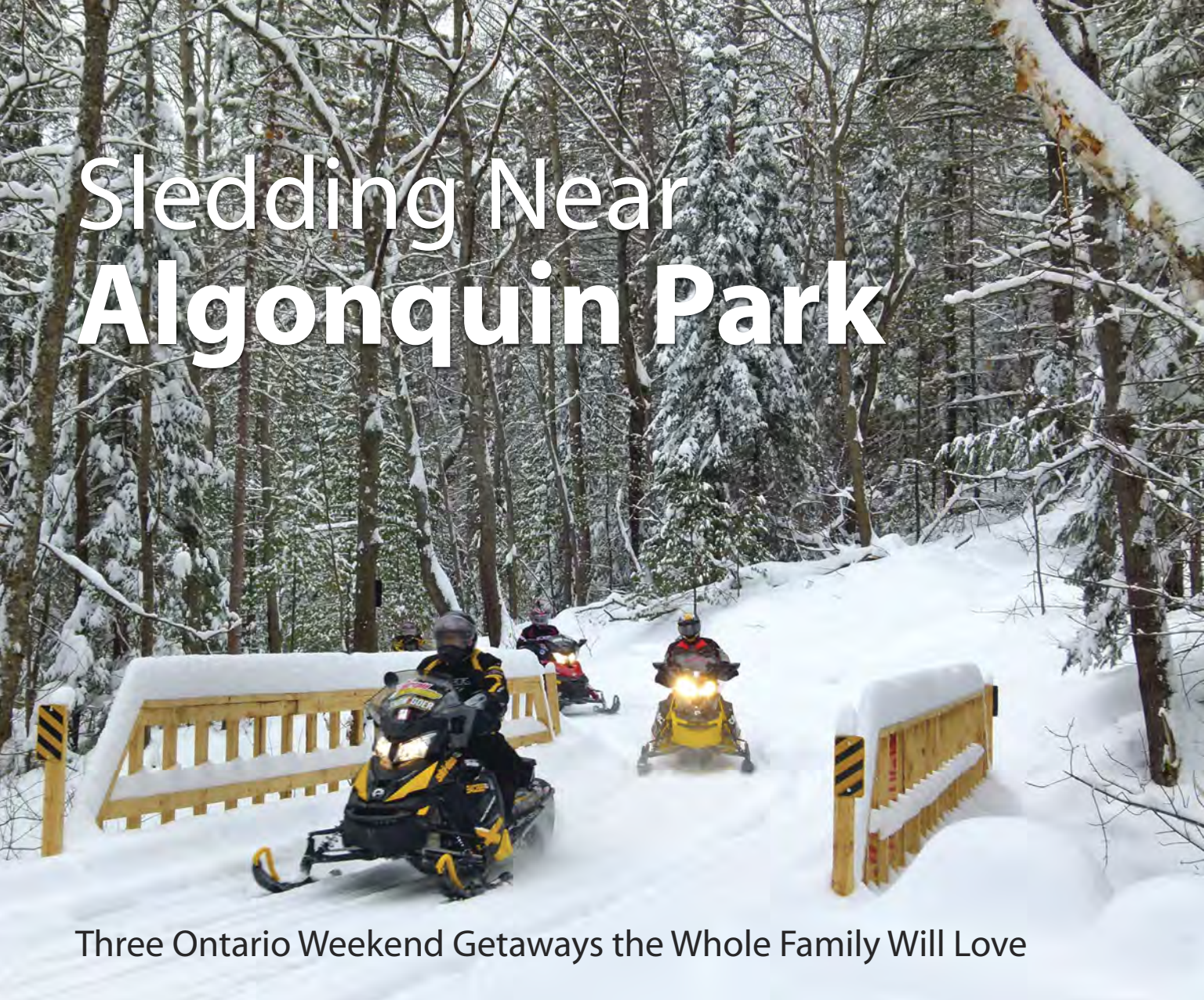
Three Ontario Weekend Getaways the Whole Family Will Love

Everyone's so busy these days that most riders don't have enough time to go snowmobiling as often as they'd like. If you do spot a free weekend on your calendar, it's unlikely that you'll have time to do much advance planning. There are many destinations across Canada for great weekend rides and to simplify your life, Snow Goer Canada has selected three in Ontario, each bordering on the world famous Algonquin Park. Best of all, if you want to make a family or couples weekend of it, we're also highlighting snowmobiling-friendly staging hotels that boast all the amenities and are located where there's plenty to keep any non-snowmobilers occupied while you're off sledding!