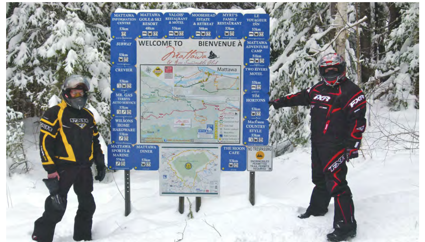
New sign boards make navigation easy.

Snowmobilers that visit the area (part of OFSC District 11) for the first