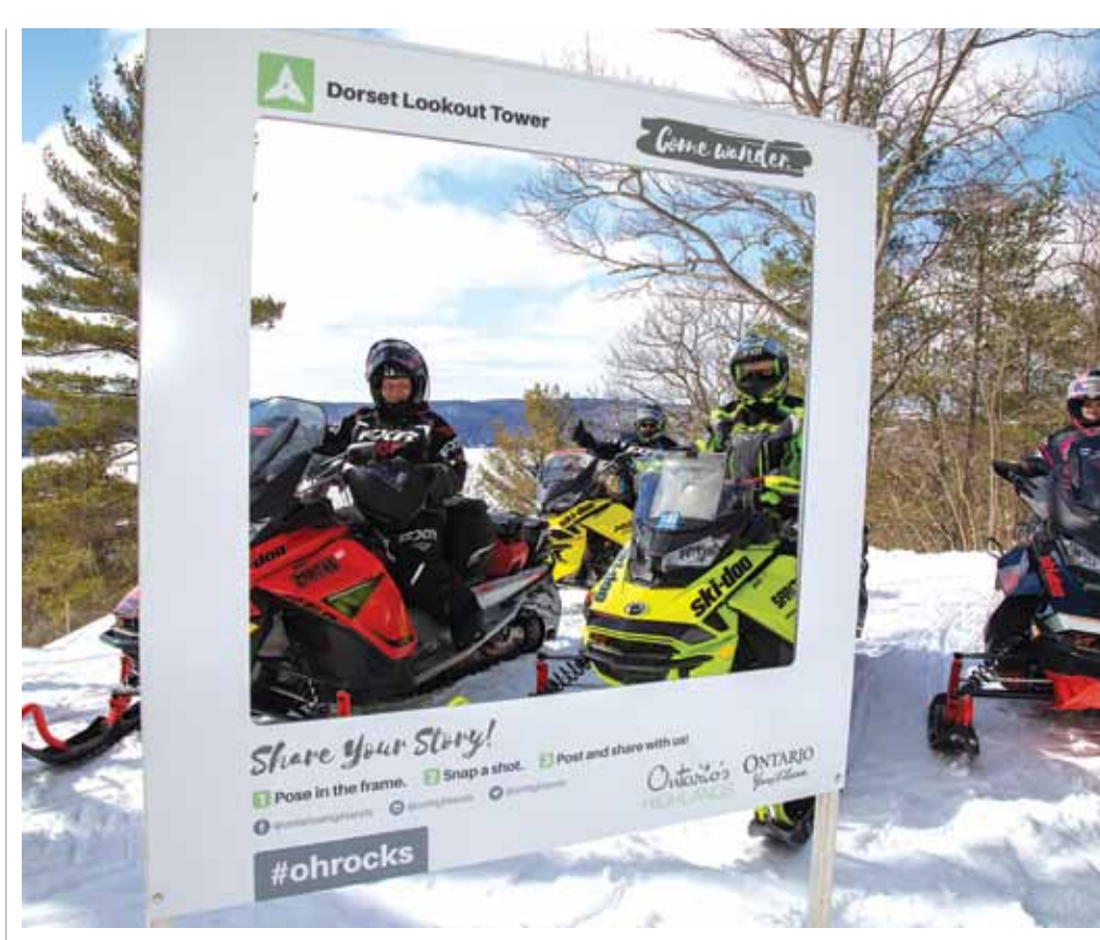
The Dorset Lookout Tower off TOP Trail D101B offers a scenic view of Lake of Bays.

Put it all together, and there's no doubt that Muskoka delivers the full package for snowmobile enthusiasts. As experienced snowmobilers who've visited most bucket list destinations, we were impressed by Muskoka riding and agreed that its trails were right up there with the best anywhere. And more than any other destination, Muskoka also may be Ontario's best choice for casual riders, couples, families, newbies and other winter lovers to share a very special, easy-going and stress-free snowmobiling adventure. GSOM