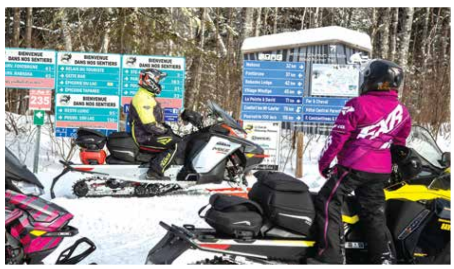
Signage like this at every intersection TOP PHOTO: Morning departure from a pourvoirie

Mont Laurier is also a real snowmobiling town, known for its many sled-accessible services and amenities, and for allowing snowmobiles to travel on snow along the south side of its main street (Hwy 177) that's actually part of Local Trail 223. For those trailering in, Mont Laurier is only