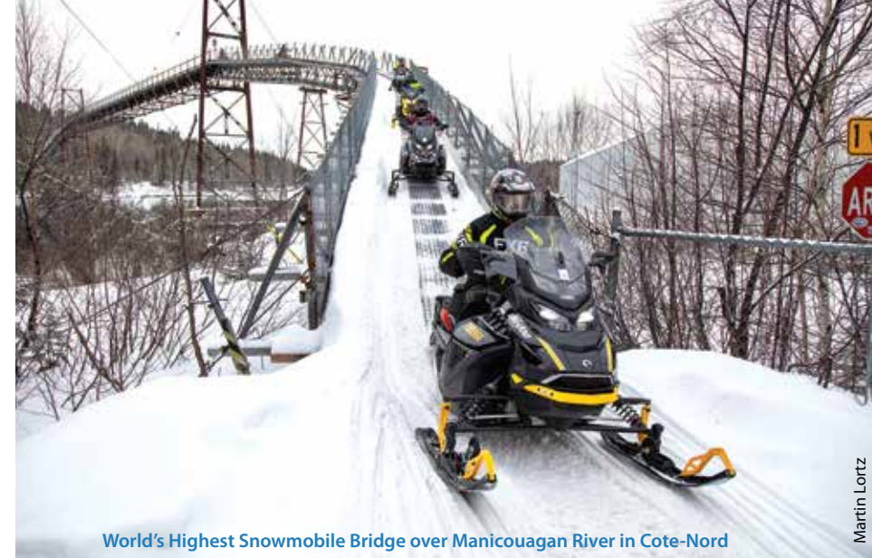
World's Highest Snowmobile Bridge over Manicouagan River in Cote-Nord

Without much fanfare, these regional partners introduced the Grand St. Lawrence Snowmobile Tour for the 2024 season. This lowkey debut provided an opportunity for their new product to be tried, tested and assessed in a real world situation, before being widely promoted to snowmobilers everywhere.