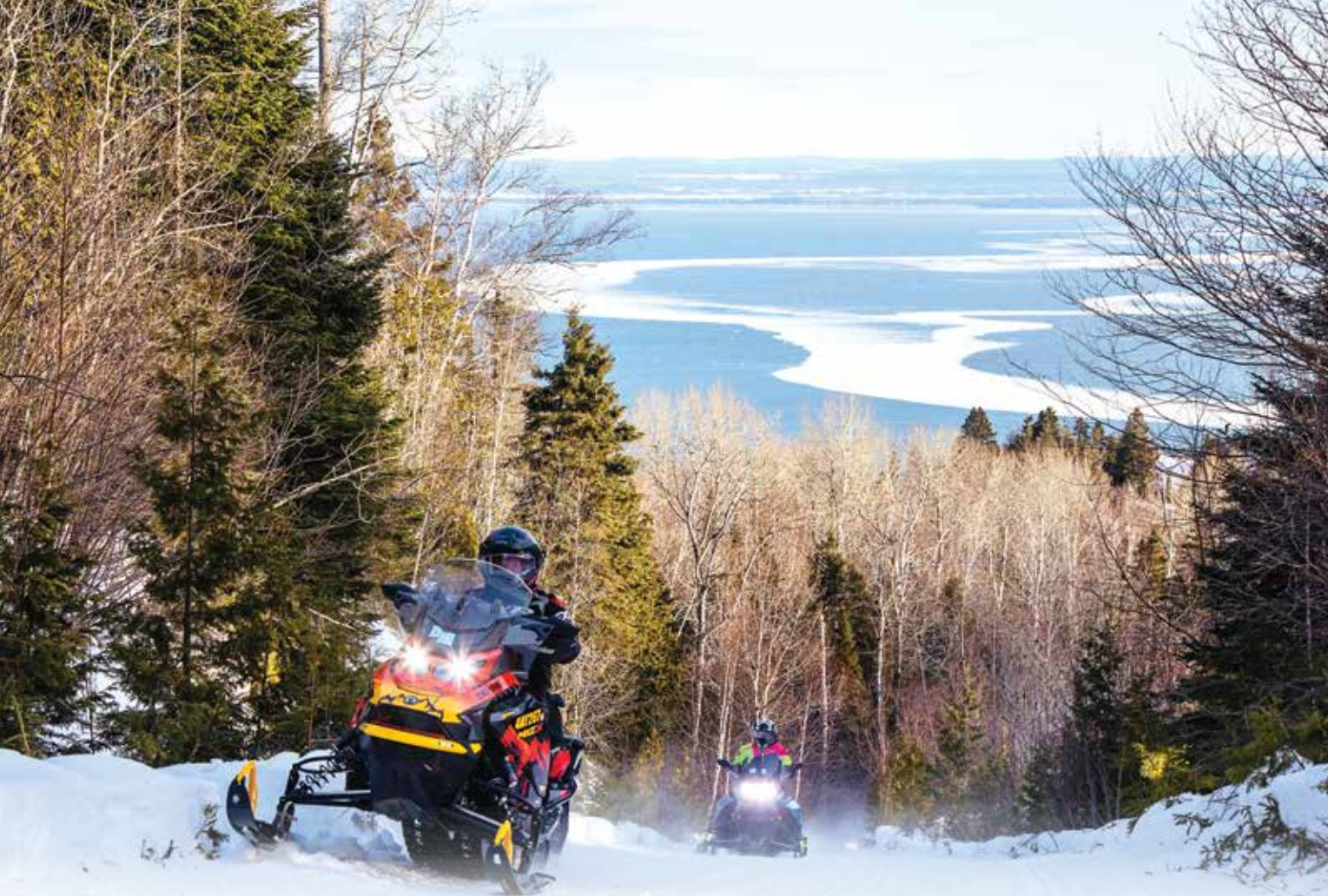
Charlevoix trail overlooking St. Lawrence River.