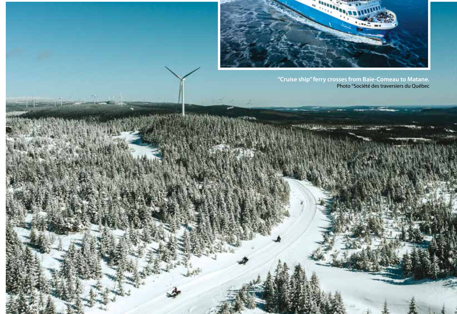
Trail thru majestic wind turbines.