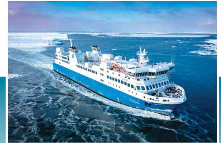
"Cruise ship" ferry crosses from Baie-Comeau to Matane.

Whatever your itinerary preference, the Grand St. Lawrence Snowmobile Tour is an epic bucket-list adventure that's also a great couples tour and will make many thumbs-up memories. So why not be among the first to give it a go by planning your own Grand St. Lawrence Snowmobile Tour loop ride this winter?